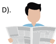
Read a newspaper